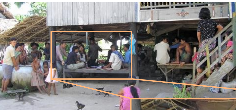
Sometimes crowds can be unavoidable, but physical placement of notetakers can help to close off the interview space. Still, some questions and topics should be avoided if some people in a crowd are listening in.