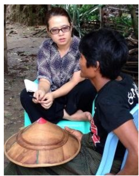
Facial expressions do not have to be robotically neutral. Generally, showing your engagement and responsiveness to the content and tone of respondents' message can be achieved without showing too much emotion.